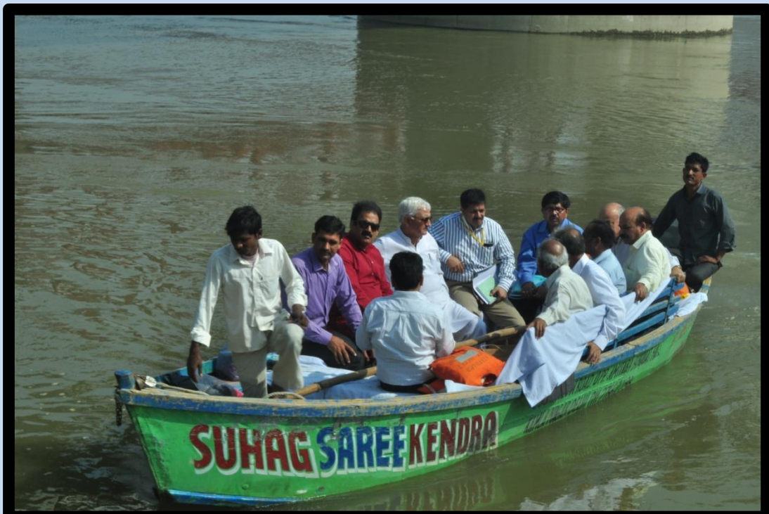
Inspection of erosion affected site on river Ganga in Farrukhabad, Uttar Pradesh by Shri Salman Khurshid, Hon'ble Union Minister (Water Resources)