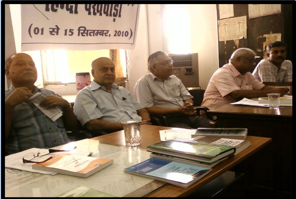
Valedictory function of the Hindi Fortnight 2010-11 held from 1.9.10 to 15.9.10