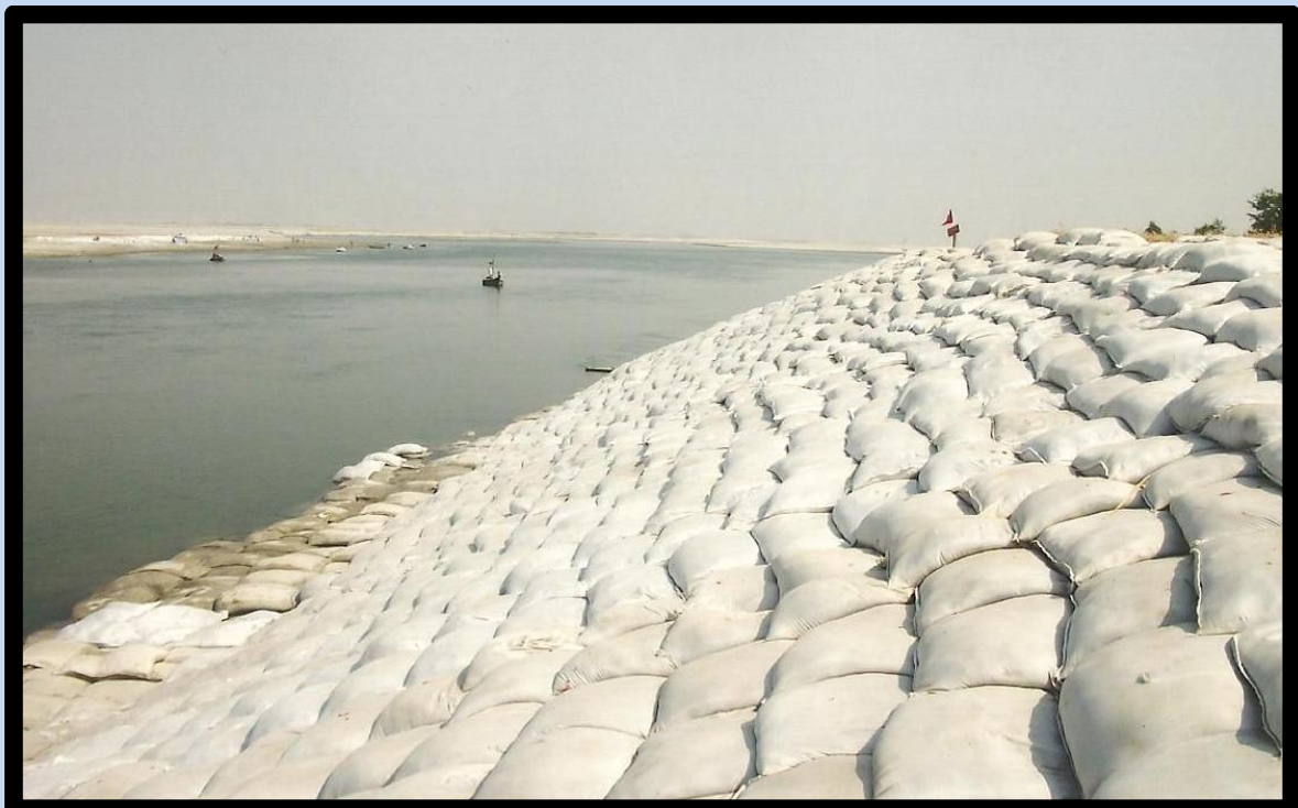
Anti-erosion works -slope pitching with launching apron using geobags on river Ghagra in Lakhimpur Kheri District, Uttar Pradesh