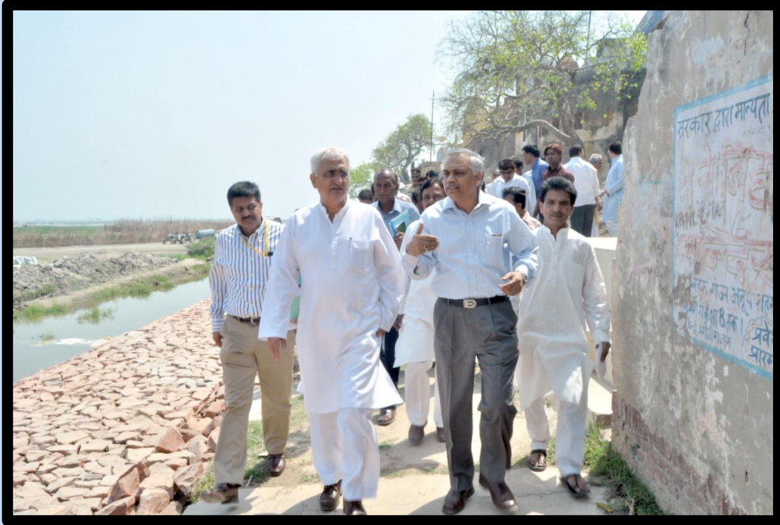
Inspection of ongoing works under Flood Management Programme on river Ganga in Anoop Shahar, Uttar Pradesh by Shri Salman Khurshid, Hon'ble Union Minister (Water Resources)