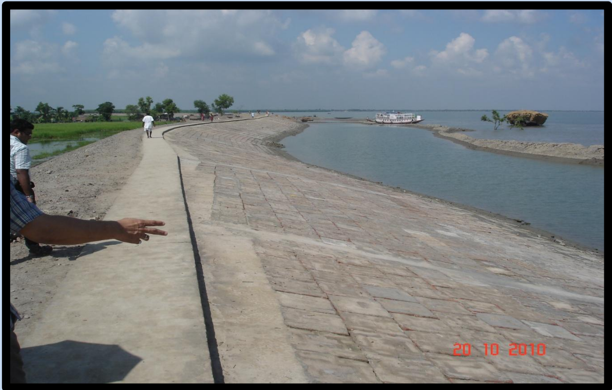
Construction of bank protection works on river Raimongal under FMP in West Bengal