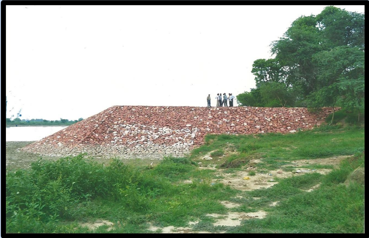
Construction of anti-erosion works (spur) on river Yamuna in Mathura, Uttar Pradesh