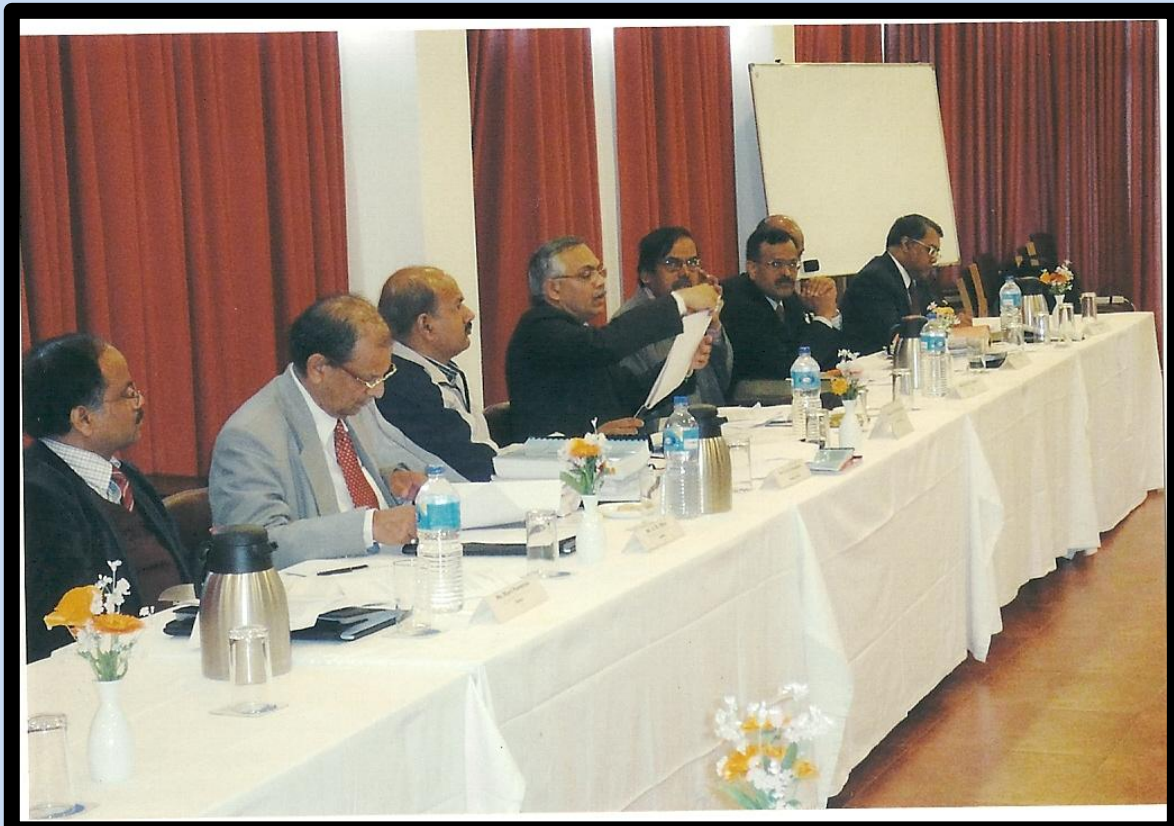
Fourth meeting of India-Nepal Joint Committee on Inundation and Flood Management (JCIFM) during 10-14 January 2011 at Kathmandu