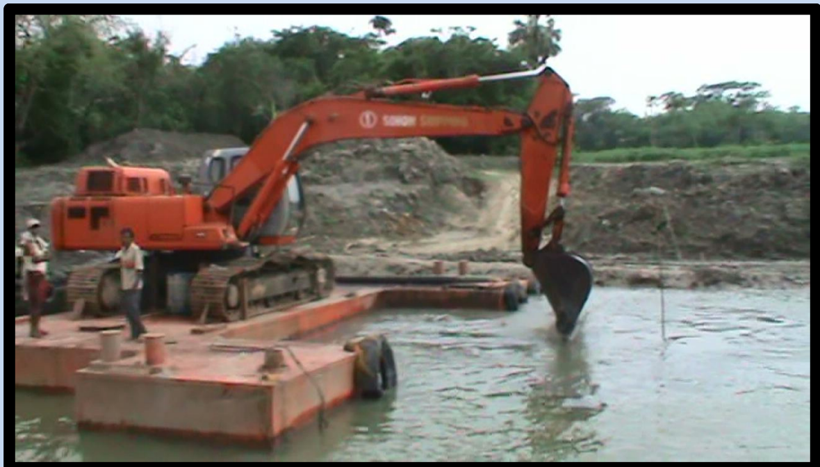
Works for Desilting of river Ichamati on common / border stretch on Indo-Bangladesh border